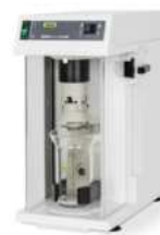
Mixer B-400 Grinding and homogenization