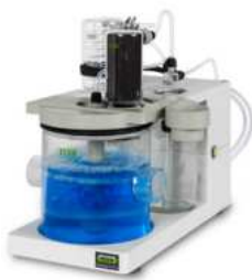
Scrubber K-415 Neutralization