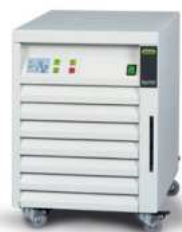
Recirculating Chiller F-108 The efficient way of cooling