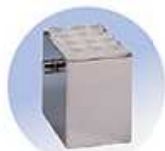
1.5ml x 48pcs