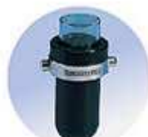
50ml x 4pcs (glass)