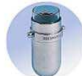
100ml x 4pcs