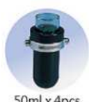
50ml x 4pcs (glass)