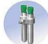
15ml x 8pcs