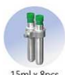
15ml x 8pcs