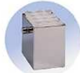
1.5ml x 48pcs