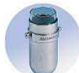
100ml x 4pcs