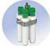
15ml x 16pcs