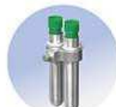
15ml x 8pcs