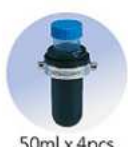
50ml x 4pcs (plastic)