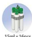
15ml x 16pcs