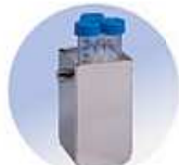
15ml x 12pcs (plastic)