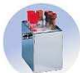
6ml x 40pcs