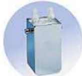
6ml x 36pcs