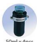
50ml x 4pcs (glass)