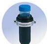
50ml x 4pcs (plastic)