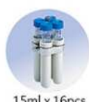
15ml x 16pcs