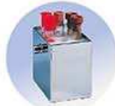
6ml x 40pcs