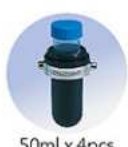
50ml x 4pcs (plastic)