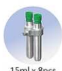
15ml x 8pcs