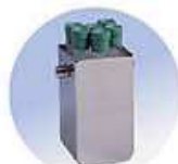
10ml x 24pcs