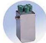
10ml x 24pcs