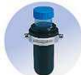
50ml x 4pcs (plastic)