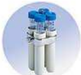
15ml x 16pcs