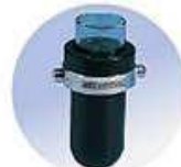
50ml x 4pcs (glass)