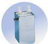
6ml x 36pcs