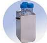
15ml x 12pcs (plastic)