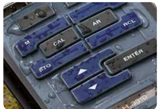
Robust sealed silicone keypad - 100% waterproof