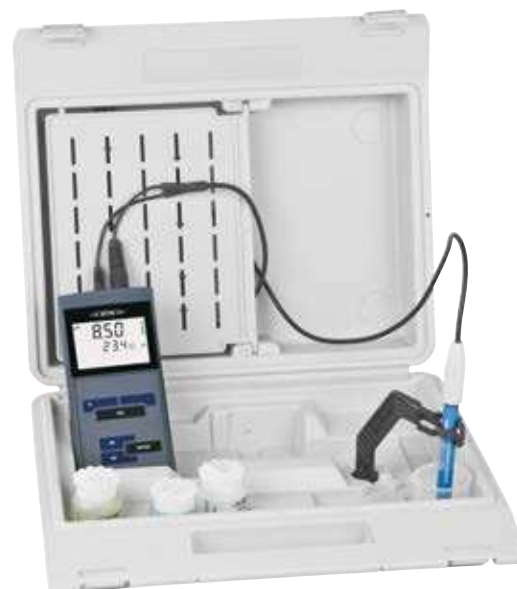
Set in case

For more detailed information please order free of charge our catalog "Lab and Field Instrumentation" or visit our web site : www.wtw.de/en/produkte/labor (For convenience use our QR code).