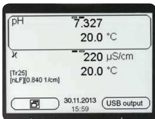
Display with two measured values