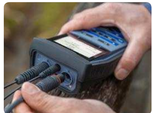
With waterproof mini USB-B interface for up-to-date data transfer.