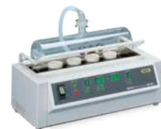
Wet Digester B-440 Incineration