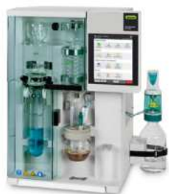
KjelMaster K-375 Steam distillation and titration