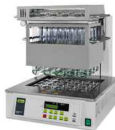
KjelDigester K-446 / K-449 Block digestion