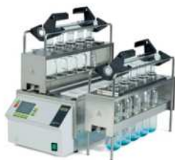
SpeedDigester K-439 / K-425 / K-436 IR digestion