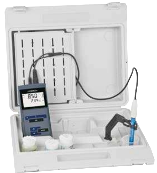
Set in case