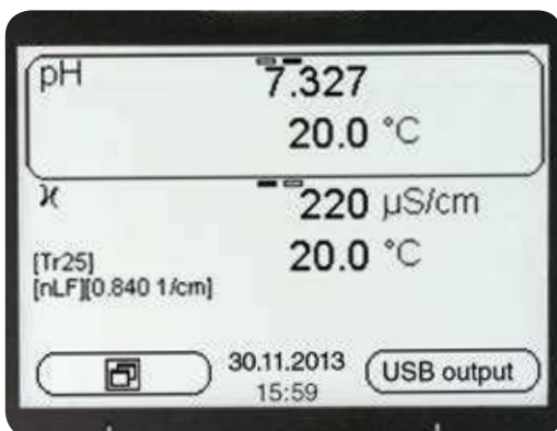
Display with two measured values