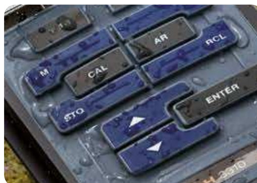
Robust sealed silicone keypad - 100% waterproof