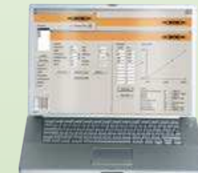
LSdata -Software for • GLP-compliant data management • Programming of user-defined programs