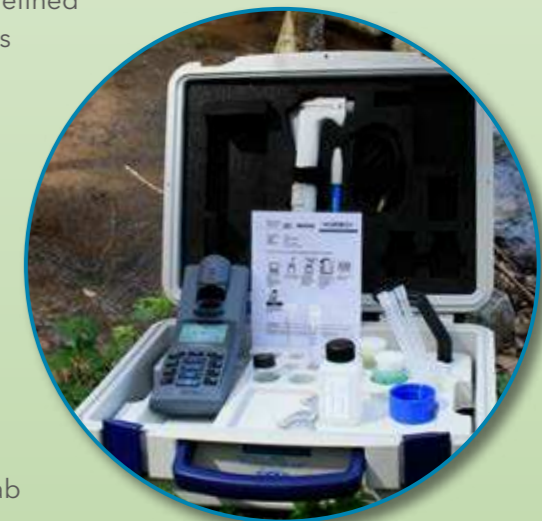
Field Sets: the mobile lab