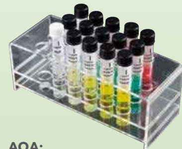
AQA: pHotoFlex® Check