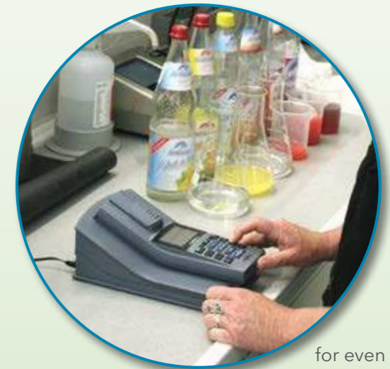
LabStation for even more comfort