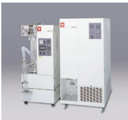
Example of installation: ADL311S-A + Stand with casters (option) + GAS410