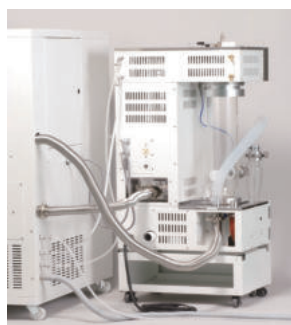
ADL311S-A + Stand with casters (option)+GAS410