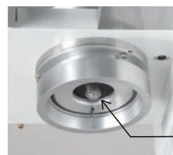
Two-way nozzle system