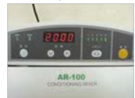
● Control panel