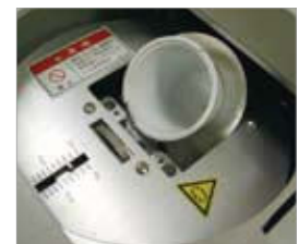
● Container holder, Balance adjustment dial