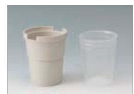
● Accessories: Containers