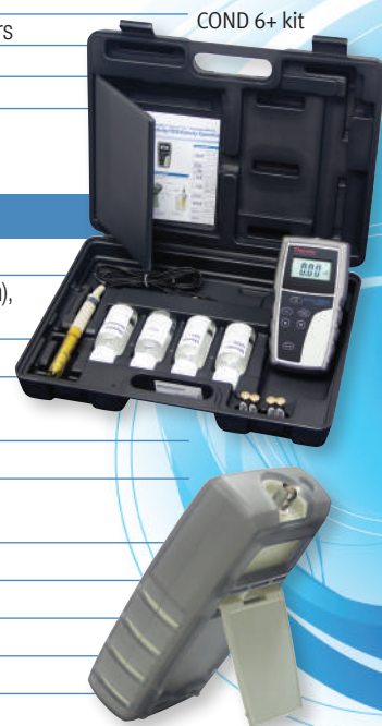
COND 6+ kit Protective rubber armor with benchtop stand