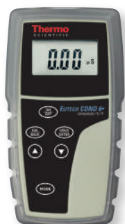
COND 6+ handheld conductivity meter