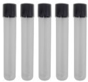
Glass test tubes 16mm BS-050102-MK

Glass Test Tubes 16x100mm, high borosilicate, PP Cap with silicone pad. Packing - 100 pcs/box