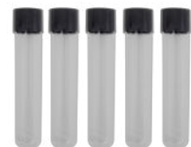
Glass test tubes 18mm BS-050102-NK

McFarland Turbidity Standards, \varnothing 12mm