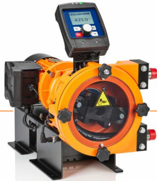
DULCO flex Control DFYa