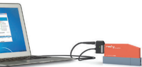
Fig. 2 Configuration of the devices via the free get red-y software