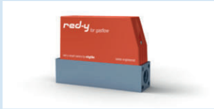
smart meter GSM Thermal mass flow meter