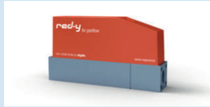
smart controller GSC Thermal mass flow controller