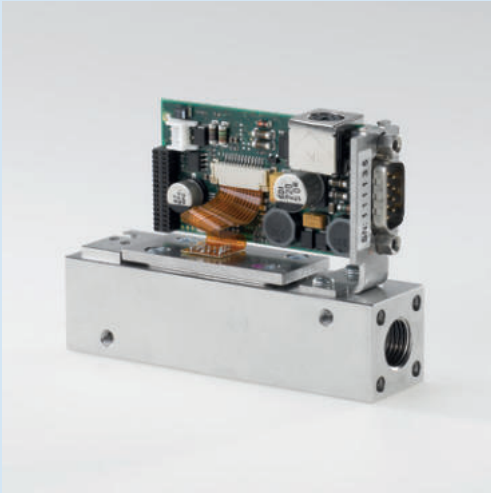
Fig. 3 High-tech in a very compact design: The flow meters and controllers use advanced MEMS technology

Through the application of high-precision MEMS technology (CMOS sensors), the thermal flow meters and controllers from Vögtlin Instruments GmbH set new standards in terms of response characteristics and measuring accuracy, and are characterized by maximum convenience: