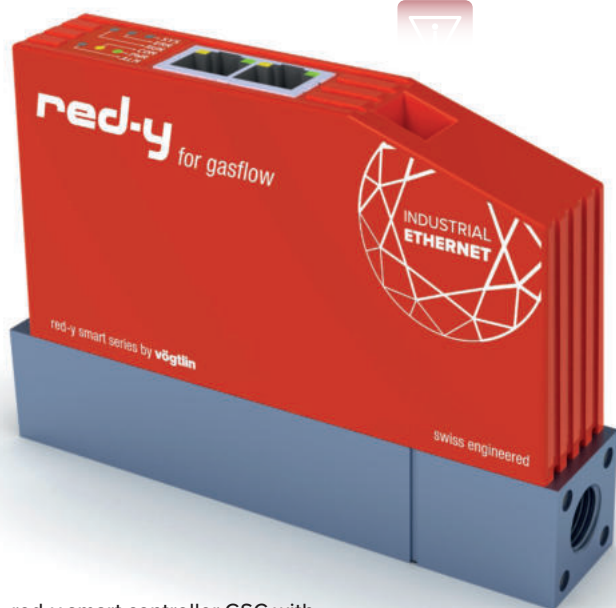
Fig. 1 red-y smart controller GSC with Industrial Ethernet interface at the top of the device