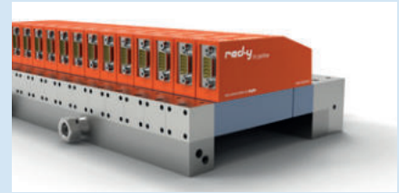
OEM version For customer-specific requirements