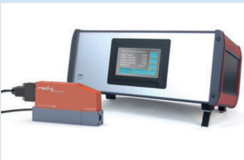
Fig. 4 Process Control Unit PCU-10