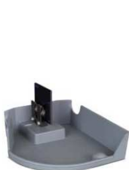
840-278100 Film/Filter Holder