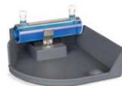
840-277800 5-100mm Path Cylindrical Cell Holder