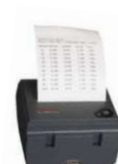
840-278000 Printer Accessory