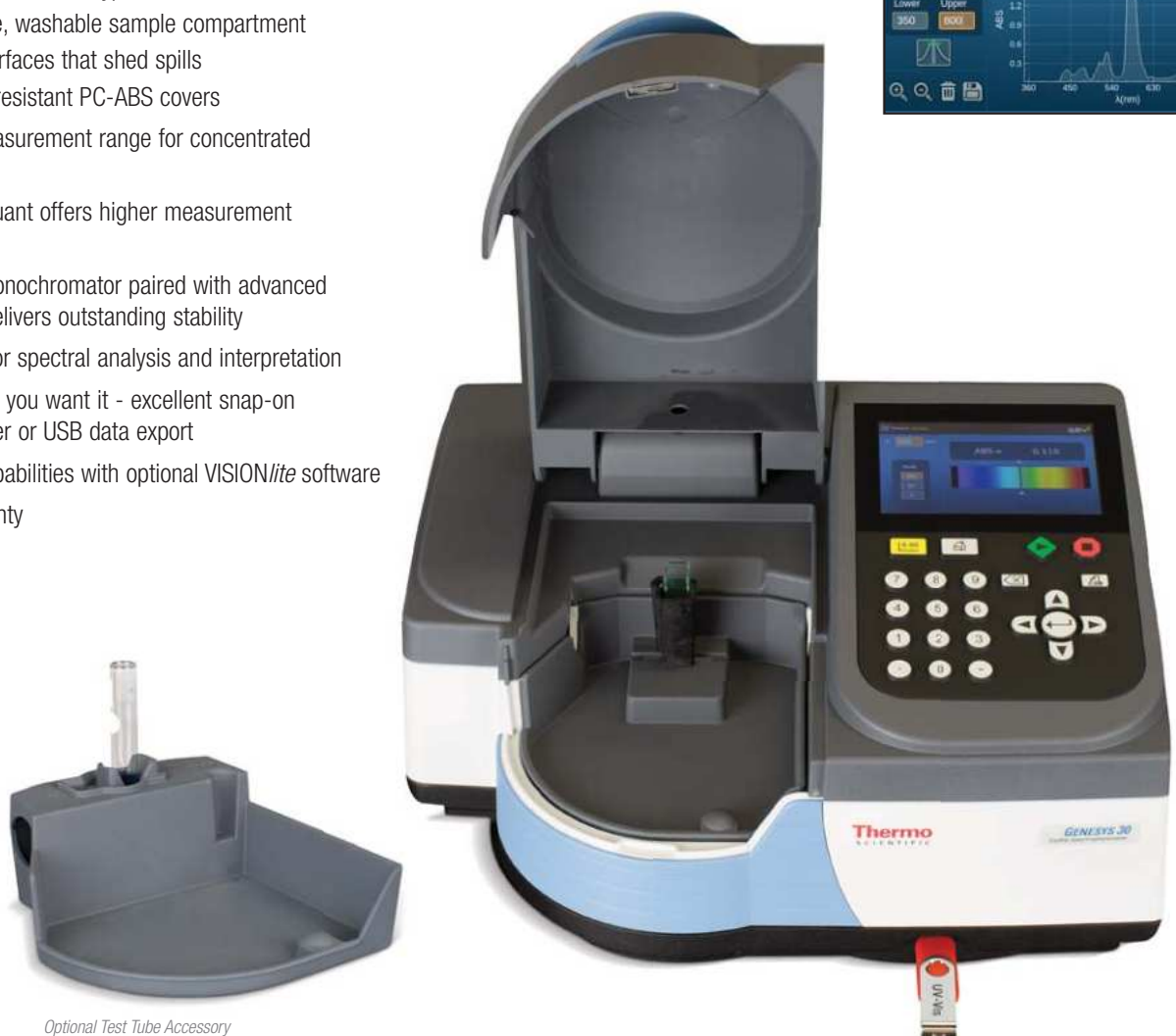
Optional Test Tube Accessory