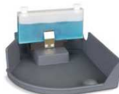
840-277700 Long Path Rectangular Cell Holder