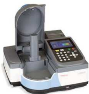
840-277600 Tall Test-Tube Cap