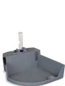
840-277500 Test-Tube holder