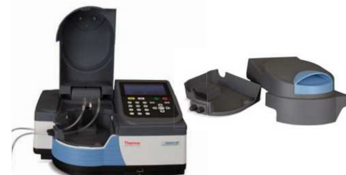
840-278200 Accessory Kit For Hose Entry/Exit