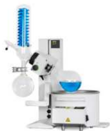
Rotavapor® R-100 Economical evaporation