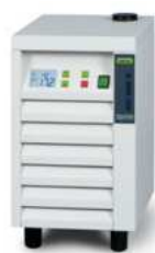
Recirculating Chiller F-100 / F-105 The easy way of cooling