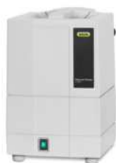
Vacuum Pump V-100 Economical vacuum source