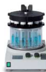
Multivapor™ P-6 / P-12 Efficient evaporation for multiple samples