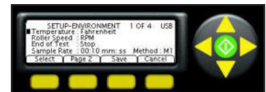
◀ Sample Menu Setups