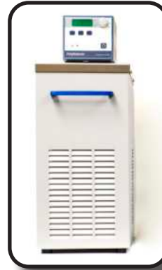
▲ Constant Temperature Circulator (CTC)