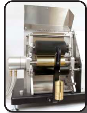
▲ Calibration Weights in Place Included with Package