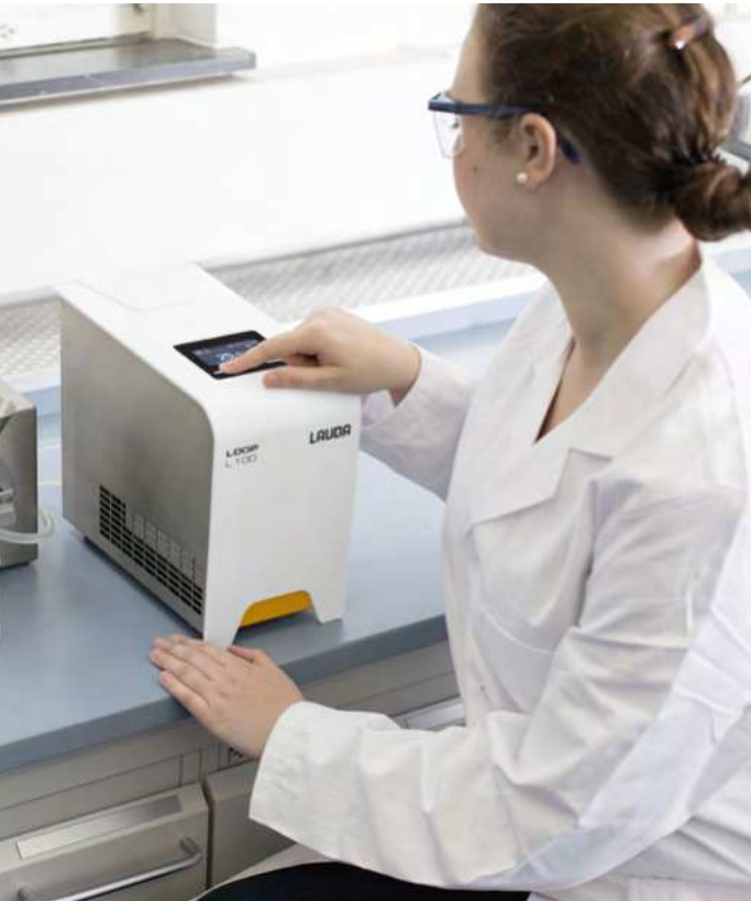
PROCESS REFRACTOMETER AT 25 °C