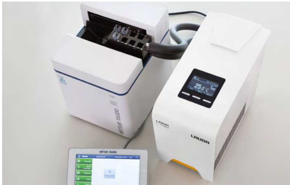
CELL CHANGER IN A UV/VIS DEVICE BETWEEN 10 AND 80 °C