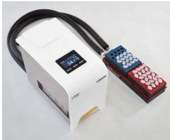
TEMPERATURE CONTROL THERMOSTATING OF SMALL SAMPLE SIZES IN THE LABORATORY