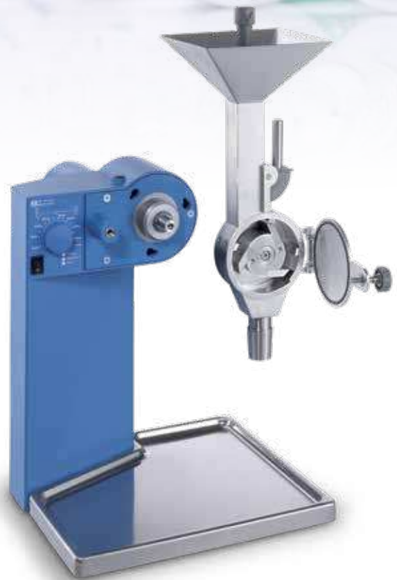
MF 10 basic microfine grinder drive MF 10.1 cutting-grinding head

Glass containers are a very essential and critical commodity for the pharmaceutical industry especially for storage of drugs, vaccine and other pharmaceutical products. The container provides a varying degree of protection, depending on the nature of the product and the hazard of the environment, as well as reduces the loss of its constituents. The container should not react with the content in such a way that it alters its quality beyond the official requirement. Thus, the quality and the composition of the glass containers are of critical importance to pharmaceutical companies. Consequently, the quality department rigorously tests the glass containers to ensure they meet the regulatory standards.