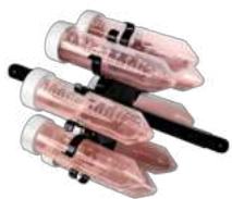
M-8/50 BS-010117-PK platform

10 tubes 25-30 mm diameter (50 ml tubes).