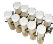
PRSC-10 BS-010117-LK platform

Can accommodate 22 tubes 16 mm diameter (15 ml).