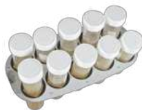
PRS-10 BS-010117-IK platform

5 tubes 20-30 mm diameter (50 ml tubes) and 12 tubes 10-16 mm diameter (1.5-15 ml tubes).