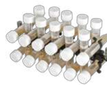
PRSC-22 BS-010117-LK platform

10 tubes 20-30 mm diameter (up to 50 ml tubes).