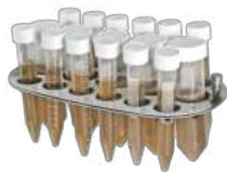
PRS-5/12 BS-010117-HK platform

Can accommodate 26 tubes 10-16 mm diameter (1.5-15 ml).