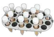
PRS-26 BS-010117-GK platform

Can accommodate 26 tubes 10-16 mm diameter (1.5-15 ml).