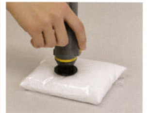
[Measurement of powder]

Optional attachments allow measurement of samples with a variety of shapes.