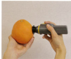
[Measurement of curved surface]