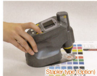
Stapler type (Option)