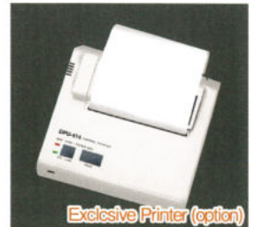
Exclusive Printer (option)