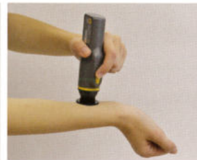
[Measurement of wet surface]