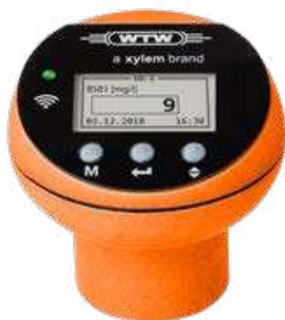
Oxitop®-IDS For all applications except biogas

The new OxiTop®-IDS is a modern measuring instrument for all kinds of respirometric studies. Regardless whether aerobic or anaerobic examinations, because of its versatility the OxiTop®-IDS is suited for both. All heads can be used independently from any meter for normal BOD measurements between one and seven days.