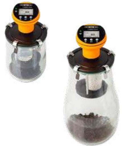
OxiTop®-IDS B6M 2.5 for AT4 tests