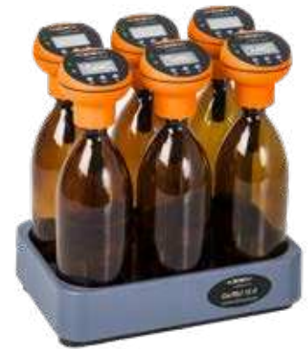
OxiTop®-IDS Set IS6

All measurements with the OxiTop®-IDS can be documented with a data acquisition program (download from www.wtw.com ) using the USB interface of the meter.