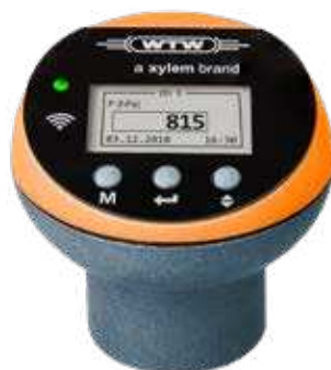
Oxitop®-IDS/B for all applications including biogas