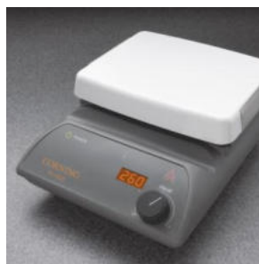
Model PC-400D shown