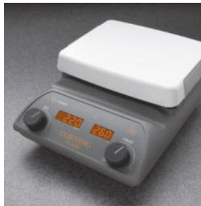
Model PC-420D shown