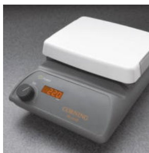
Model PC-410D shown