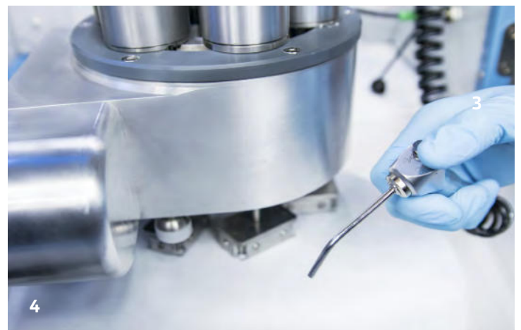
1: PM6 Precision Lapping & Polishing System 2: Metered abrasive feed unit via peristaltic pumps 3: Bluetooth enabled automatic plate flatness monitor 4: Integrated sample cleaning with de-ionised water and nitrogen gun