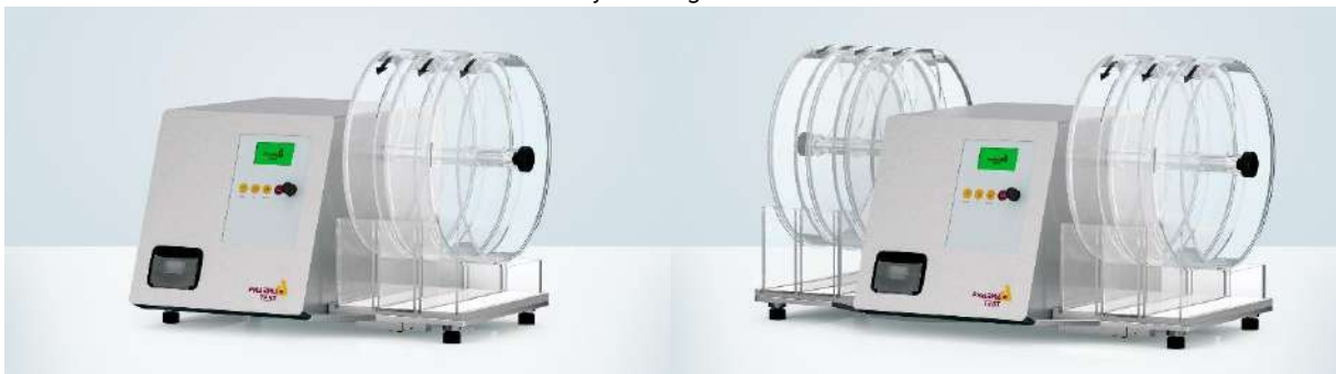
PTF 310 and PTF 610 friability testing instruments with 3 and 6 drums