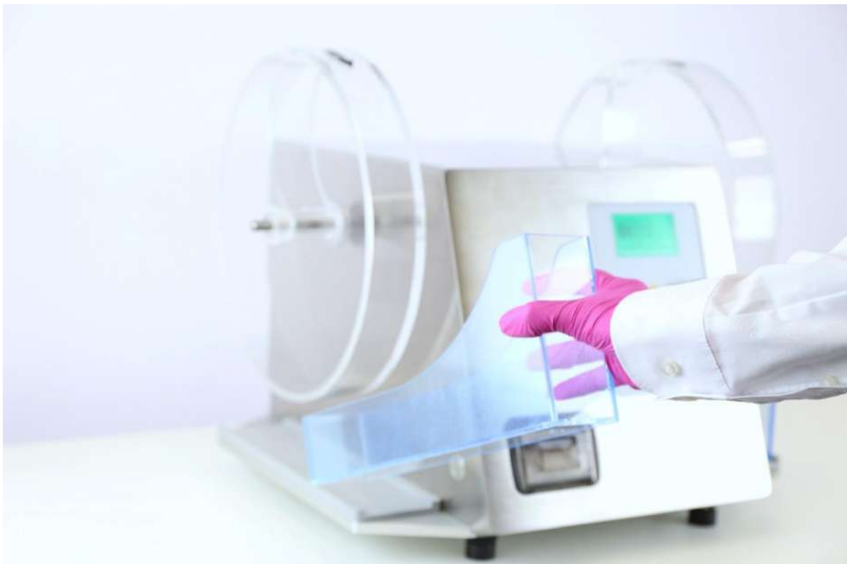
The waste containers are held by magnets and are easily removed for cleaning