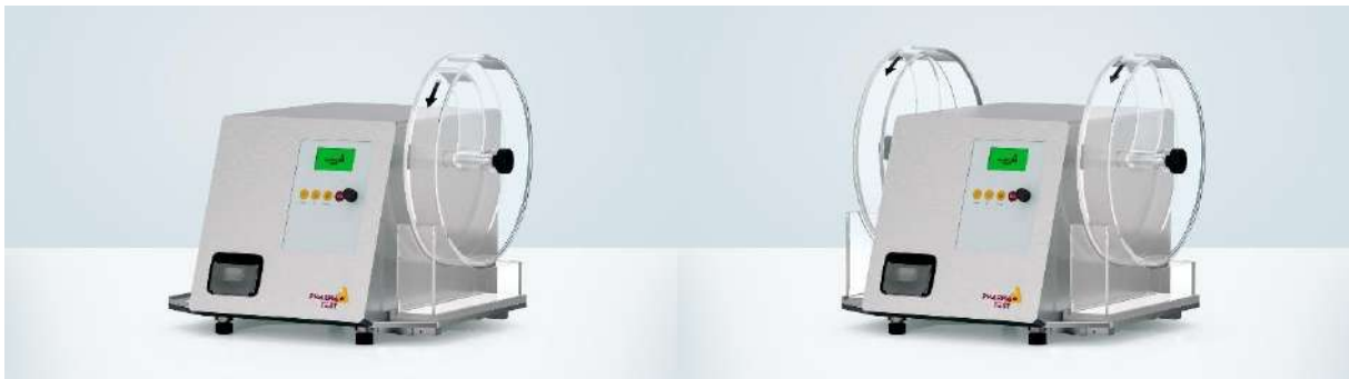
PTF 110 and PTF 210 friability testing instruments with 1 and 2 drums