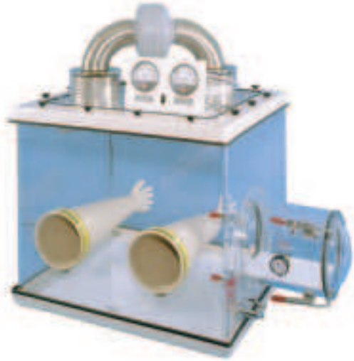
#830-ABB/CLC (Closed Loop Glove Box) #830-ABB/CLC/EXP (Export-Closed Loop Glove Box)