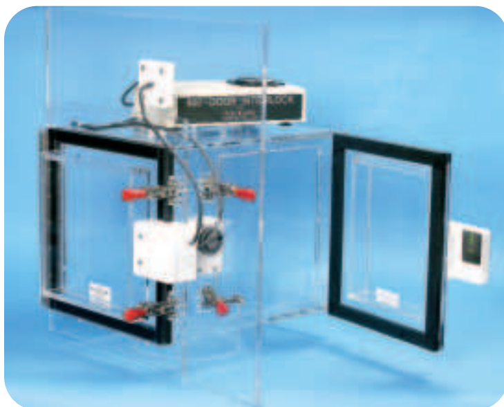
Square Transfer Chamber with #800-DOOR/ILOCK

Please refer to page #15 for door and glove box dimensions. To include a transfer chamber with the #830-CP unit order #800-TRANS-CH . Specify desired location of transfer chamber.