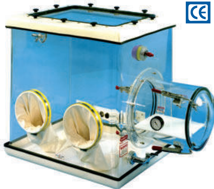
#830- ABC Compact Glove Box #830- ABC/EXP (Export Model)

North American 115-120 Volts, 60 Hz. 12 Amps. Export models 220-240 Volts, 50 Hz. Amps will vary as to end users country.