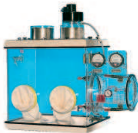
#830-ABC/SPCL/800-HEPA/S (Open Exhaust Style) #830-ABC/EXP/SPCL/800-HEPA/S (Export)