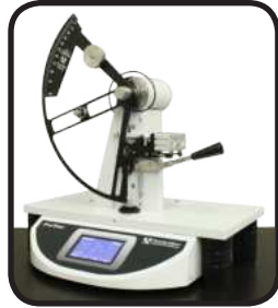
Electronic Model 200 Gram Pendulum

Precision and accuracy are increased by capturing data in real-time digitally. The capacity can be changed quickly with easy-mount technology for pendulum installation that does not require tools. Testing capacity ranges from 200g up to 12,800g allowing for a variety of applications with one machine.