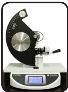
Electronic Model 1600 Gram Pendulum

The touch-screen display allows for quick clamping and testing. Lab technicians can easily customize units of measurement to their screen preference. Other functions include data entry of sample information such as sample ID, thickness, basis weight, sample direction and number of plies being torn.