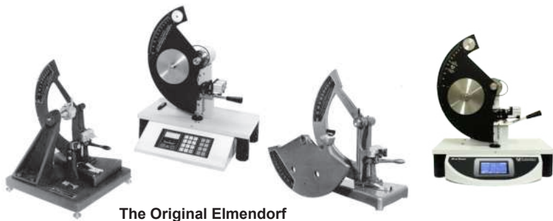
The Original Elmendorf