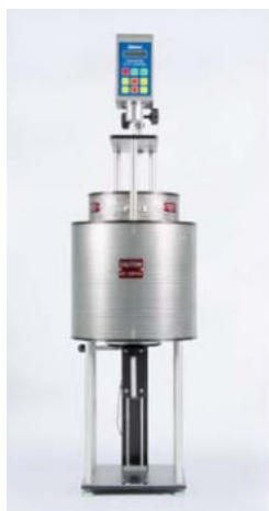
Molten Glass Viscosity as a Function of Temperature

(Rotating Spindle Viscometer – for ASTM C-965 Procedure A)