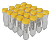
TubeSpin® Bioreactor 50 - 20 BS-010158-AK 50 ml tubes with membrane filter TPP TubeSpin® Bioreactor 50, 20 pcs.