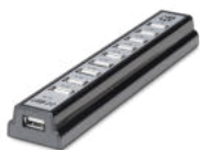
USB 2.0 Hub 10 x ports BS-010158-BK