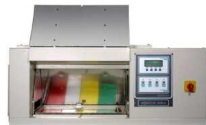
Solarbox Table top xenon testers 4 Models

We reserve the right to make changes to equipment and systems in response to advances in technology and modify parameter values accordingly.