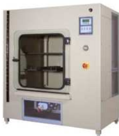
Vertical and Horizontal Salt spray chambers, 8 Models Full range of options for continuous and cycling test.