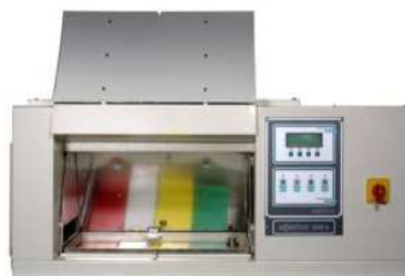
Solarbox 3000e: table top xenon testers 4 models