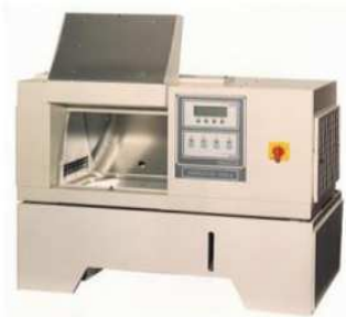
Solarbox 1500e with flooding