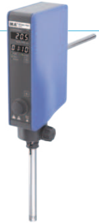
T 25 easy clean digital High-performance disperser Ident. No. 0025002560