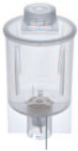
DIS-300-S-M.10 Dissolver tube Volume: up to 300 ml Application: Crushing and dissolution of tablets and dragées. This tube is equipped with a dissolver blade and opens up new application fields. It was especially designed for dissolving samples in different solvents. Ident. No. 0020016318