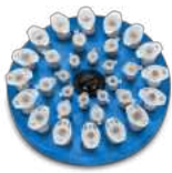
PV-32 BS-010207-CK platform