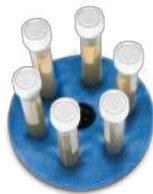
PV-6/10 BS-010207-BK platform

Platform for 6 × 10 ml tubes (max diameter 15 mm).