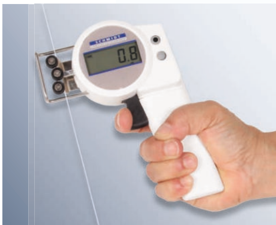
Model ZEF-100-T with easy running plastic rollers to measure Spandex (Lycra) filaments

Special calibration using customer supplied samples is available: Please supply a sample of at least 5 m in length.