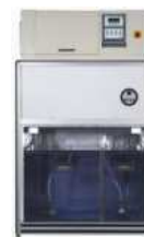
SOLARBOX R.H. with Humidity Control

We reserve the right to make changes to equipment and systems in response to advances in technology and modify parameter values accordingly.