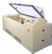
Horizontal Salt spray chambers.