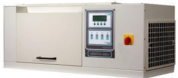
SOLARBOX 3000 E

Consequently, because the temperature produces an accelerated ageing, it is essential to be able to control of B.S.T. during exposure to filtered Xenon radiation.