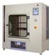
Vertical Salt spray chambers.