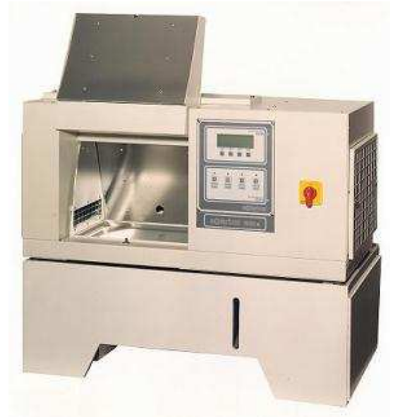
SOLARBOX 1500 E with FLOODING

PVC and corrosion-resistant materials ensure long life of this tank pump system: capacity up to 50 litres.