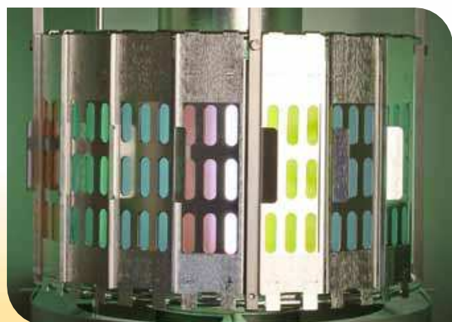
SEPAP MHE Specimen Rack

To simulate the effects of water, the SEPAP MHE+ is equipped with a specimen spray system.