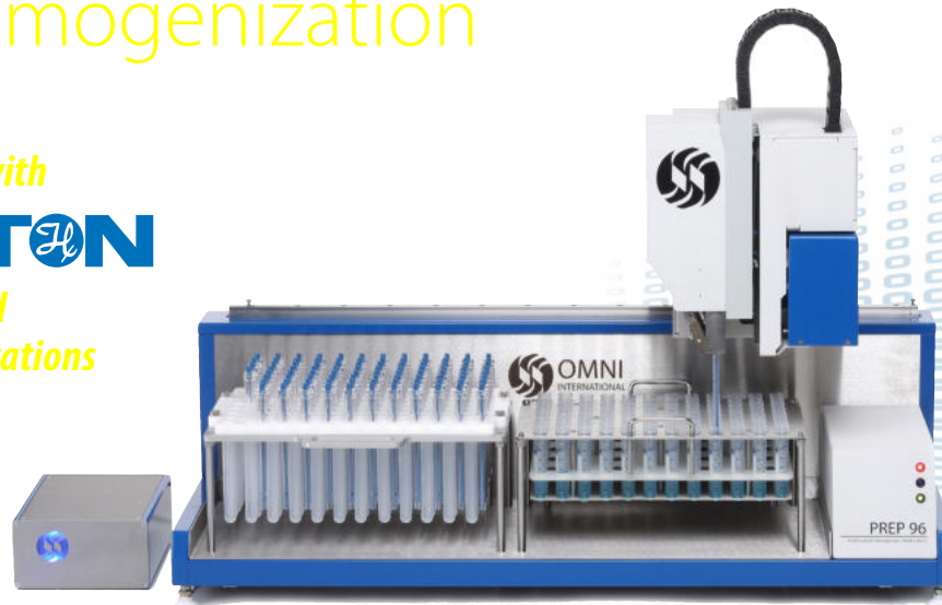
Omni Prep 96 Automated Sample Prep Homogenizer Workstation

Compatible with HAMILTON Star Liquid Handling Workstations