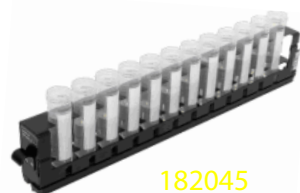
14/15 mL Conical Tubes