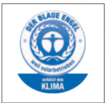
2003 – Blauer Engel