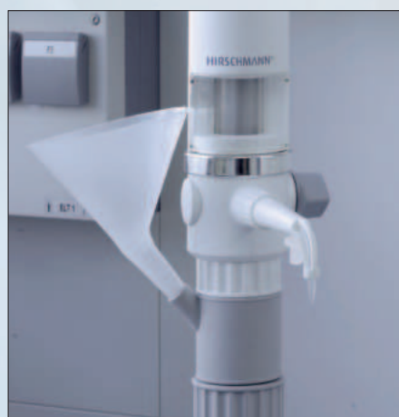
Adapter with NS 12/21 filling tube for funnel The adapter with standard ground 12/21 filling tube enables problem-free filling of medium through a funnel - without unscrewing the basic unit.