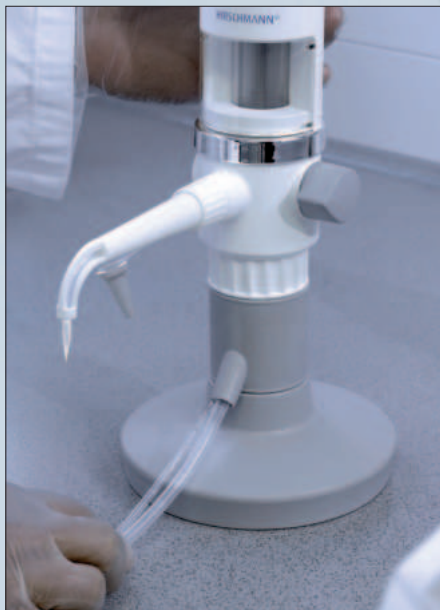
Base support instead of bottle attachment The base support enables suctioning of the medium directly from a separate storage container using a hose.