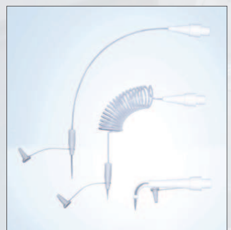
Ejection units with fine tips These even finer tips facilitate precision realization of the finest droplets. Variable and spiral ejection units with fine tips allow the user to achieve exactly the results required in practically every area of application.