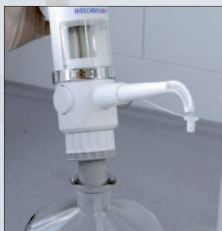
Ground adapter for direct reagent extraction from a ground bottle The NS 29/32 ground adapter enables secure use of the basic unit on standard ground bottles.