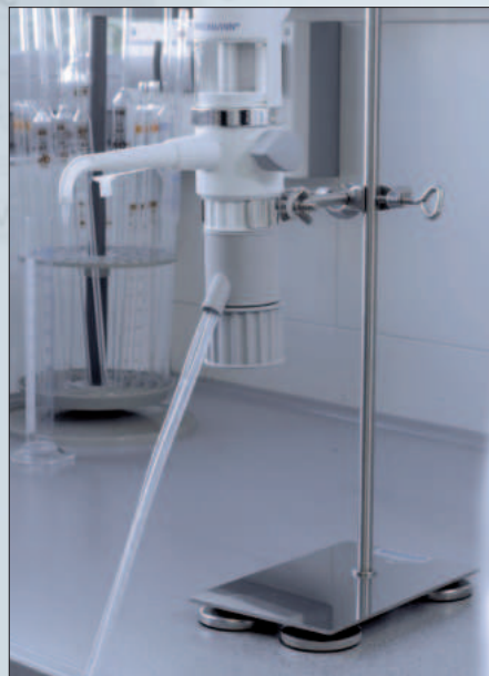
Stand clip for fixing the basic unit The stand clip also facilitates use of solarus® in a stand assembly.