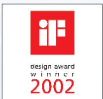
2002 – iF Design Award, Hanover