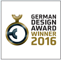
2016 – German Design Award