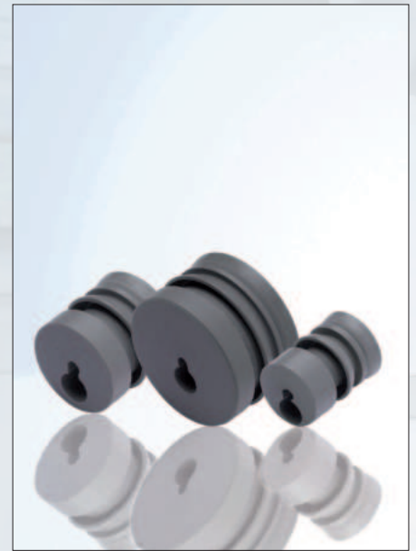
Spare piston units The piston can be replaced easily by the user without the need for tools.