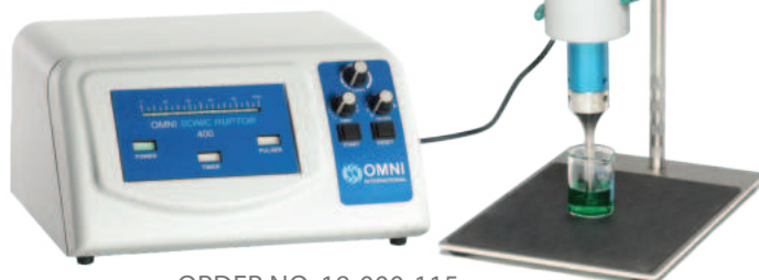
ORDER NO. 18-000-115