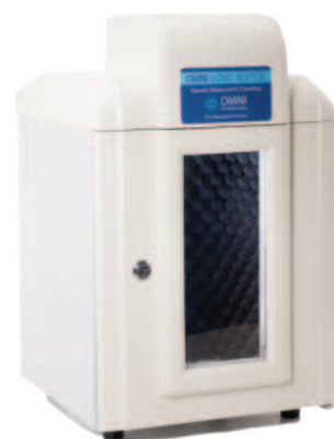
ORDER NO. OR-A-01