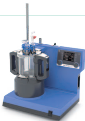
LR 1000 control System Laboratory Reactor Ident. No. 0025001991

If required, the following IKA devices are available for your lab to enhance product development with STARVISC: