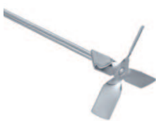
R 1345 Propeller stirrer, 4-bladed

Standard stirring element. For drawing the material to be mixed from the top to the bottom. Local shearing forces. Generates axial flow in the vessel. Used at medium to high speeds.