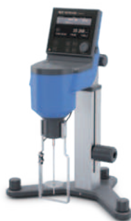
ROTAVISC lo-vi Complete Viscometer Ident. No. 0025000310