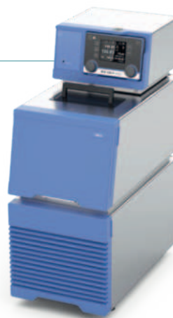
CBC 5 control Refrigerated and heating circulator Ident. No. 0004167000