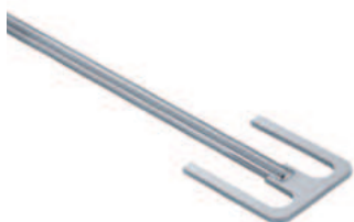
R 1330 Anchor stirrer

Tangential flow, high shearing rate at edges, minimum deposits on the vessel wall. Used at low speeds. Polymer reactions, even distribution of high mineral contents in liquids. The ideal stirrer for medium to highly viscous fluids.