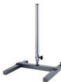
R 2723 Telescopic stand

Particularly stable stand with H-shape base which prevents the stand from tipping backwards. Additionally equipped with a pneumatic spring stand rod, which enables heavy instruments/attachments to be raised and lowered smoothly without difficulty. Height: 620 - 1010 mm.