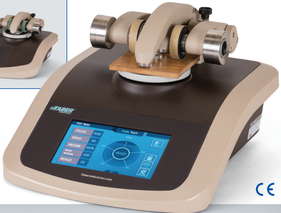
MODEL 1700 SINGLE PLATFORM ABRASER