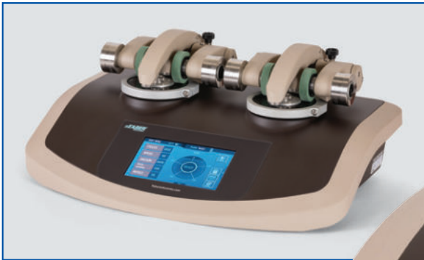
MODEL 1750 DUAL PLATFORM ABRASER